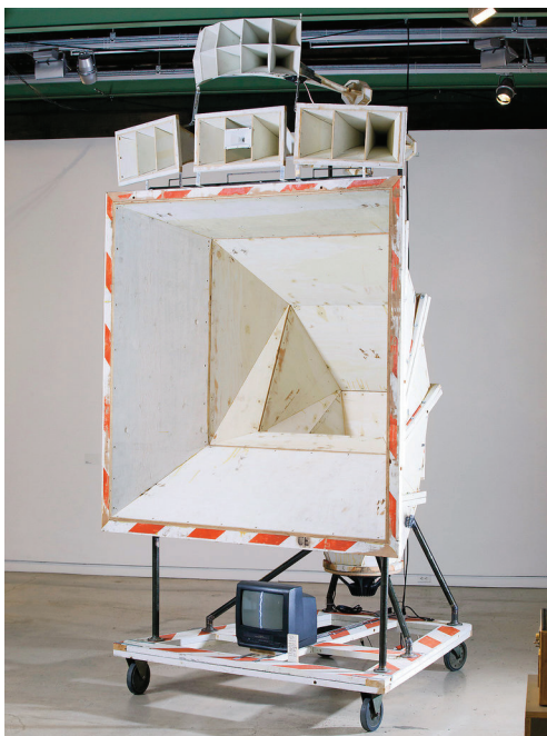
“Euronor,” 2012, made from barricades and a small TV to create a new hybrid machine.