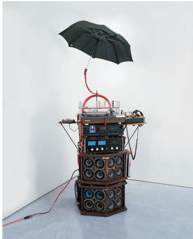
An example of Sachs’s “haute bricolage” in “Gu-ru’s Yardstyle,” 1999, with stacked speakers on a dolly cart.

The artist and his team were racing to complete the installation of “Tom Sachs: Boombox Retrospective, 1999-2015.” The exhibition collects nearly two dozen of Sachs’s imaginatively jerry-built audio devices. The show is a historical excavation — a tribute to the portable music players that occupied center stage in popular culture from the mid-’70s to the late ’80s, from the golden age of disco to hip-hop. It is also a record of Sachs’s decades-long obsession with music and the now-outmoded machines that once blasted it out into the world. “The nostalgia I feel for these boomboxes is intense,” Sachs said. “But it’s not exactly nostalgia — because I haven’t let them go. I just kind of keep building them and scattering them around my everyday life.”