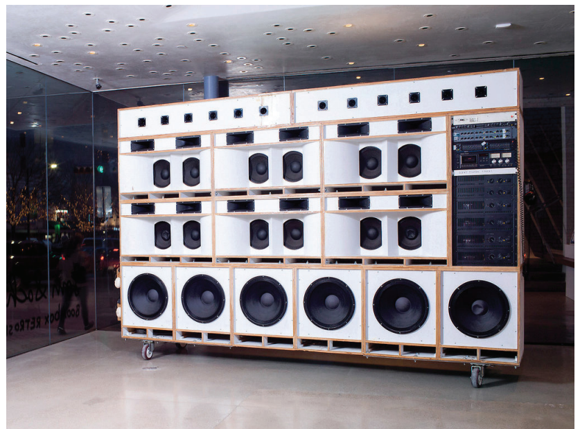
“Toyan’s,” 2002, inspired by the stereo systems used at Jamaican street parties.