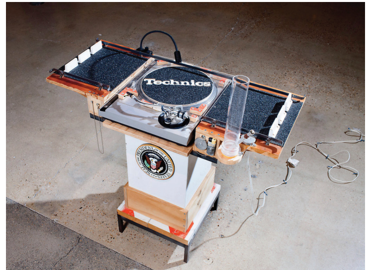
Another turntable riff from 2002.