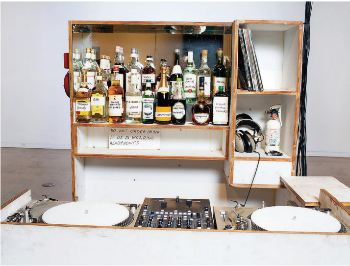
“Presidential Vampire Booth,” 2002, a boombox turned bar.