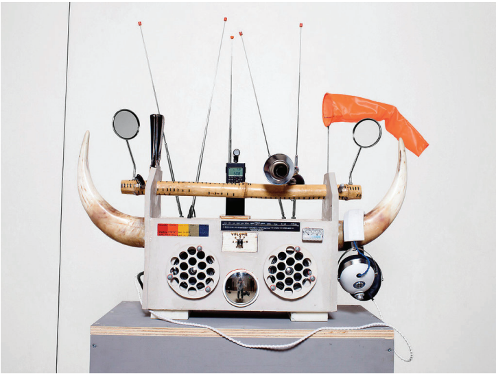
A mischievous mixed-media boombox.